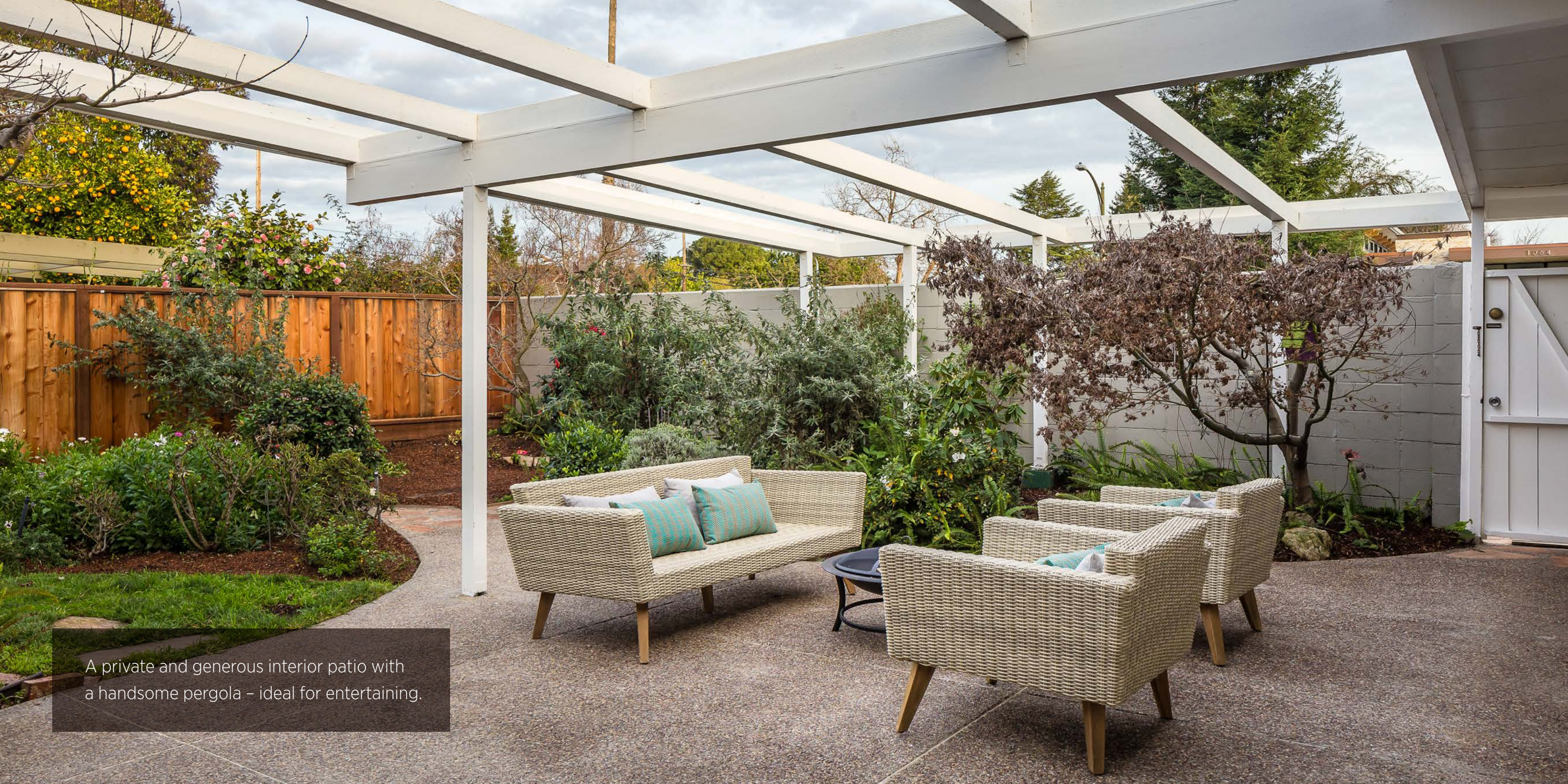
A private and generous interior patio with a handsome pergola – ideal for entertaining.