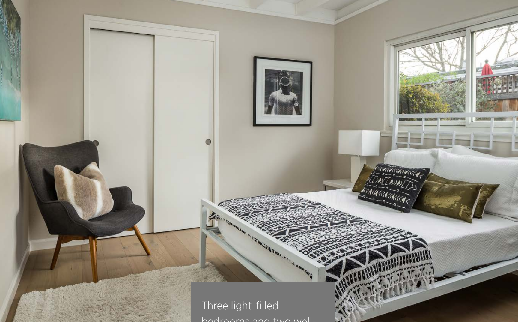
Three light-filled bedrooms and two well-appointed full bathrooms.